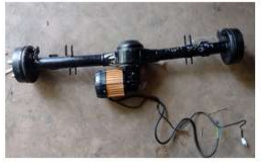
FIG.5 Differential Assembly

When the vehicle is travelling straight, the drive pinion will screen the rear axle's wheels through the differential case's ring gear, wheel-wheel