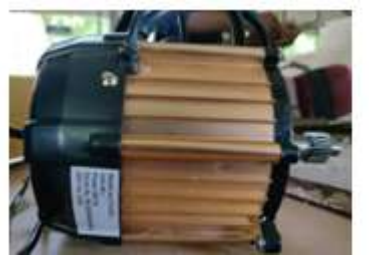
FIG. 2BLDC Motor

The popularity of brushless direct current (BLDC) motors is one of the motor types that is growing quickly.BLDC Motors are used in industries such as Appliances, Automotive. Aerospace, Consumer, Medical, Industrial, Automation, Equipment's communication; instead they are electronically commutated. BLDC motors have many