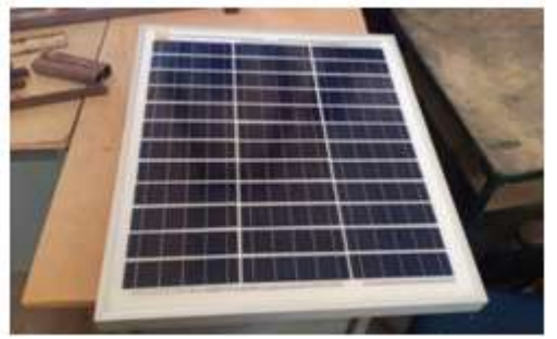
FIG.4 Solar Panel

Here the PV module is used for charging the vehicle on running mode from sunlight. Here we use Polycrystalline solar cells. In general, polycrystalline solar panels are less efficient than monocrystalline ones. In addition, polycrystalline solar panels tend to have a blue hue instead of the black hue of mono crystalline panels. Polycrystalline solar panels are also made from silicon. However, instead of using a single crystal of silicon, manufacturers melt many fragments of silicon together to form the wafers for the panel. Polycrystalline solar panels are also referred to as "multi-crystalline" or many-crystal silicon. Because there are many crystals in each cell, there is to less freedom for the electrons to move. As a result of polycrystalline, solar panels have lower efficiency ratings than mono crystalline panels, but their advantage is a lower price point. Polycrystalline solar panels tend to have slightly lower heat tolerance than mono crystalline solar panels. Polycrystalline solar panels will tend to have a higher temperature co-efficient than solar modules made with mono cells. As a result, this type of cell's output will decrease less as the temperature rises. However, in practice these differences are very minor.